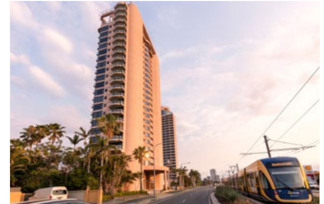
OAKS GOLD COAST HOTEL