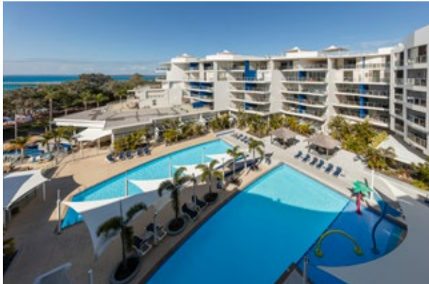
OAKS HERVEY BAY RESORT & SPA

Contact us for more information on our other conferencing and events locations in Australia.