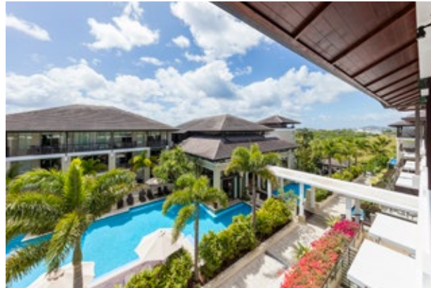
OAKS CASUARINA SANTAI RESORT