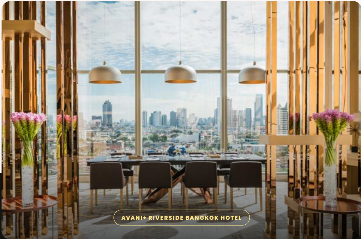
AVANI+ RIVERSIDE BANGKOK HOTEL

At Oaks – we’re not just one hotel brand. We’re part of the Minor Hotels family, and that means you’ve got access to over 560 incredible properties across 6 continents.