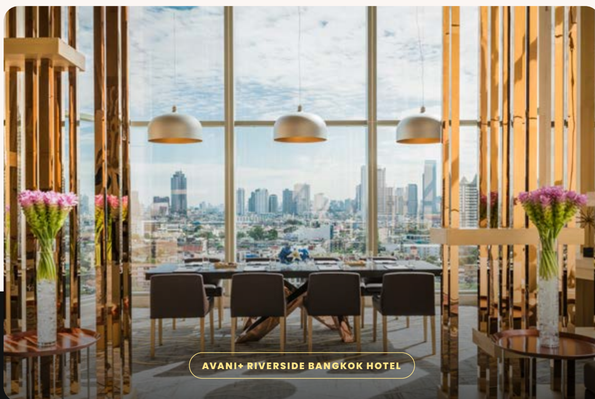
AVANI+ RIVERSIDE BANGKOK HOTEL

At Oaks – we’re not just one hotel brand. We’re part of the Minor Hotels family, and that means you’ve got access to over 560 incredible properties across 6 continents.