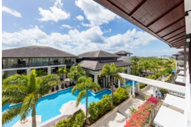
OAKS CASUARINA SANTAI RESORT