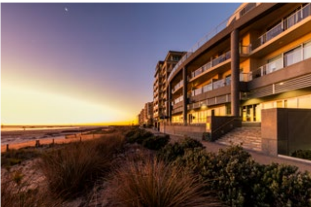
OAKS GLENELG PLAZA PIER SUITES