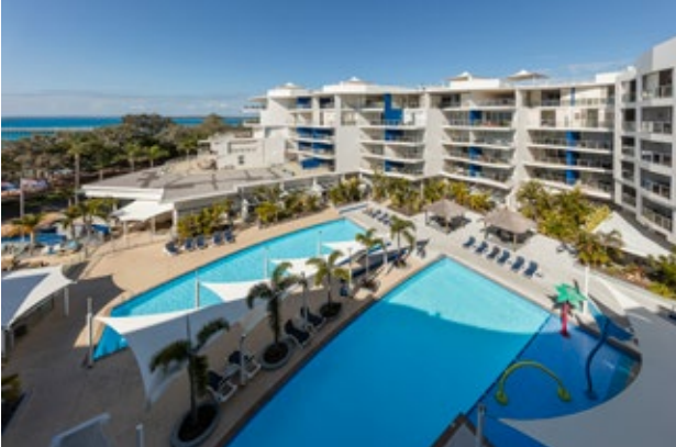
OAKS HERVEY BAY RESORT & SPA

Contact us for more information on our other conferencing and events locations in Australia.