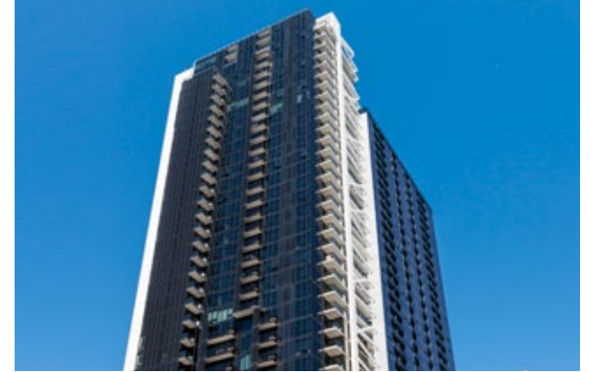
WRAP ON SOUTHBANK